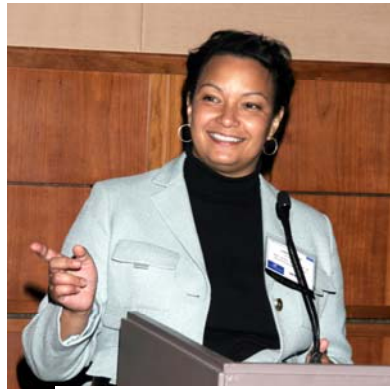
Speaker Lisa Jackson